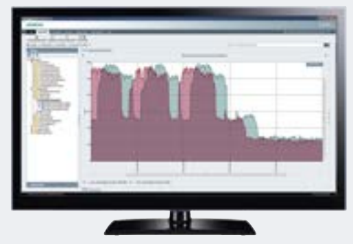
SIMATIC B.Data: Increased production transparency