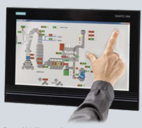
Easy and intuitive operation via multitouch gestures