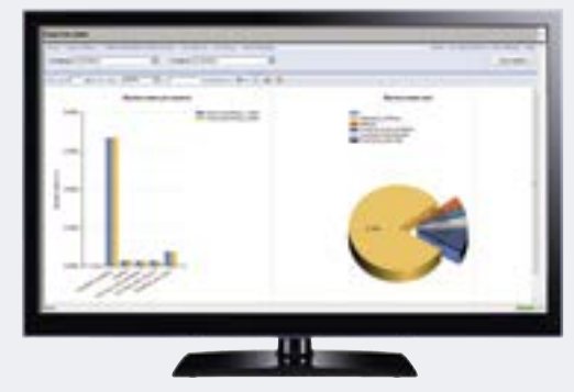
SIMATIC Information Server: Comfortable analysis and report generation