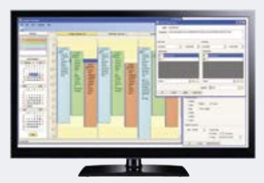
WinCC/CalendarScheduler: Planning of calendar-based events