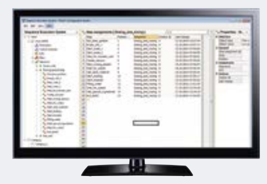
WinCC/SES: Efficiently process sequence-based recipes