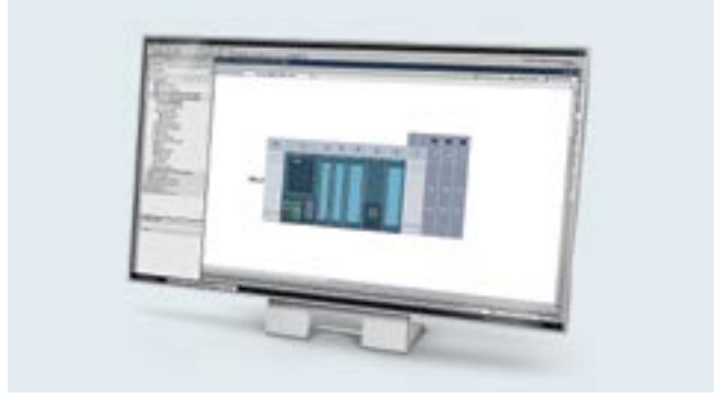
Controller Software in the TIA Portal

All hardware and software components can be compared online next to offline. This ensures fast recognition of potential differences.