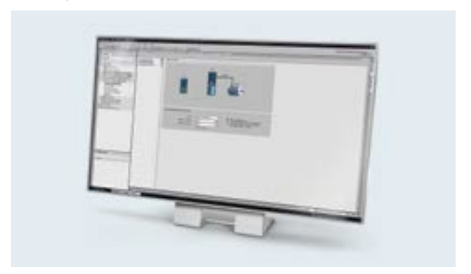
Drives Software in the TIA Portal