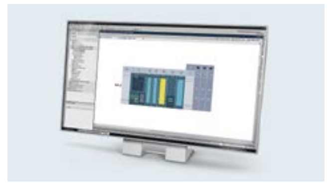
Controller Software in the TIA Portal