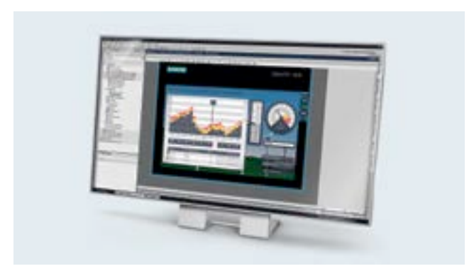
HMI Software in the TIA Portal

■ Complete data transfer in projects from WinCC flexible